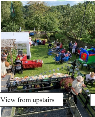
View from upstairs

We had around 80 people attend, enjoying a picnic and BBQ amongst family and friends, it was brilliant social occasion. We raised £168 in the raffle for Cornwall Air Ambulance Trust.