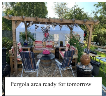
Pergola area ready for tomorrow