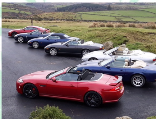
Photo of the first XK drive on Dartmoor

24 th October meeting at Lifton Strawberry fields at 10.30am for a breakfast meeting then a scenic drive across Dartmoor celebrating 4 years since I started the Cornwall & Devon XK group, this was the first ever drive we had done so it will be good to do it again and hopefully nice weather to see the views. Lunch at the Dartmoor Lodge Ashburton all welcome to attend.