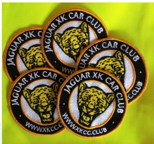
Sew-on Embroidered Badges

If you would like to purchase any items please go to https://www.xkcc.club/club-merchandise and place your order. All profits go towards the club charities.