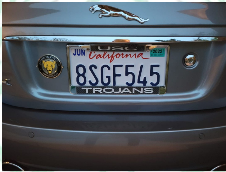
Have badge, will travel.