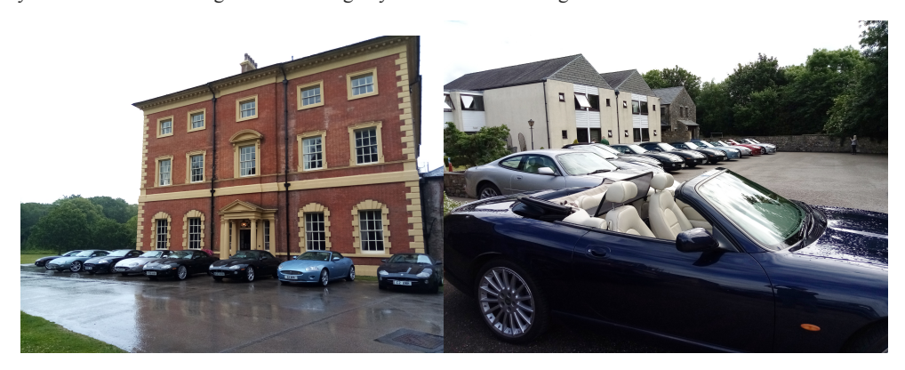
Lytham Hall and Crooklands Hotel

The NW region had a private guided tour of Lytham Hall, followed by a run out to the Crooklands Hotel in Crooklands followed by a dinner in the evening. The following day we attended the Leighton show